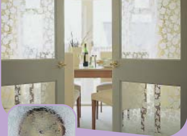
Pilkington Oriel Coppice ™