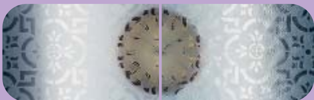
Pilkington Oriel Canterbury ™